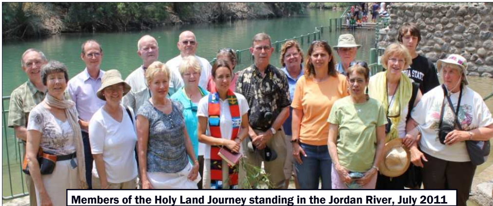
Members of the Holy Land Journey standing in the Jordan River, July 2011

We hope you and your youth can join us on this amazing pilgrimage. Please extend this invitation to your family and friends at St James or outside St James, in Wichita or outside Wichita to join us in this unique life changing experience.